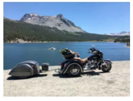
6) Yosemite National Park CA