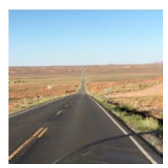
16) Monument Valley UT