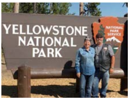
2) Yellowstone National Park WY