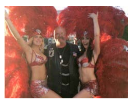
8) Las Vegas NV