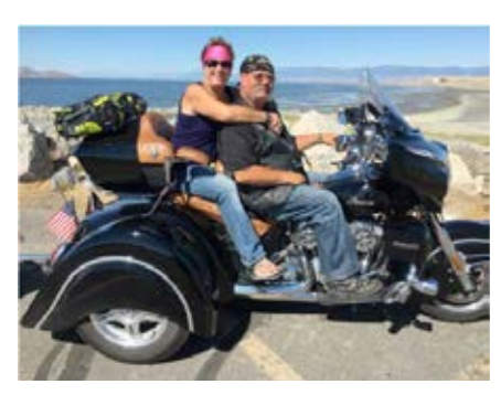
4) Great Salt Lake UT