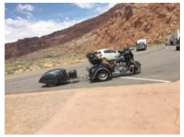
13) Moab UT 14) Moab UT