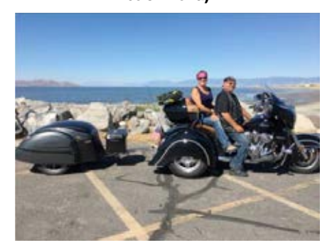
9) Great Salt Lake UT