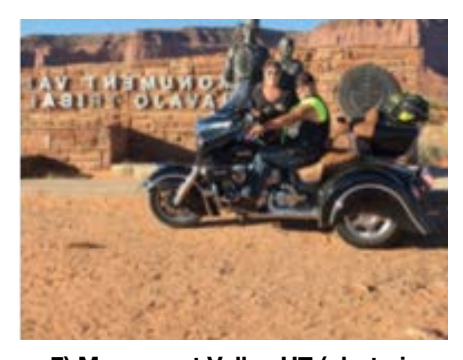
7) Monument Valley UT (photo is backward)