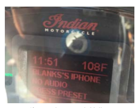
3) entering Death Valley