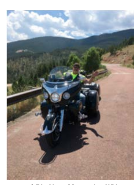
11) Big Horn Mountains WY