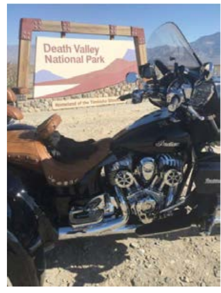
1) Death Valley CA