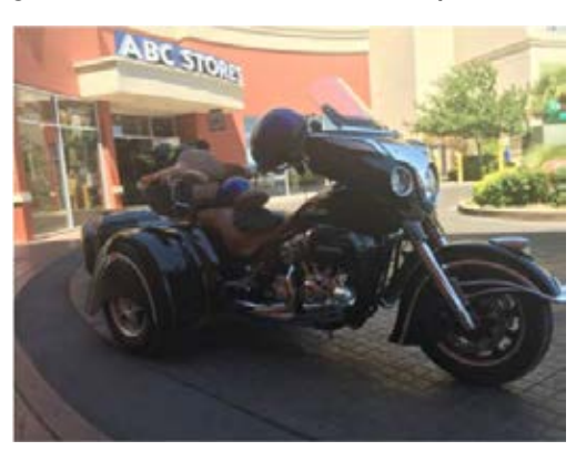
12) Las Vegas NV