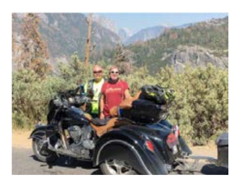
5)Yosemite National Park CA